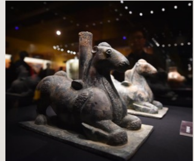
Splendid Finds – The Archaeological Excavations at the Royal Cemetery of Haihunhou Kingdom in Han Dynasty Mar – June 2016 Capital Museum, Beijing