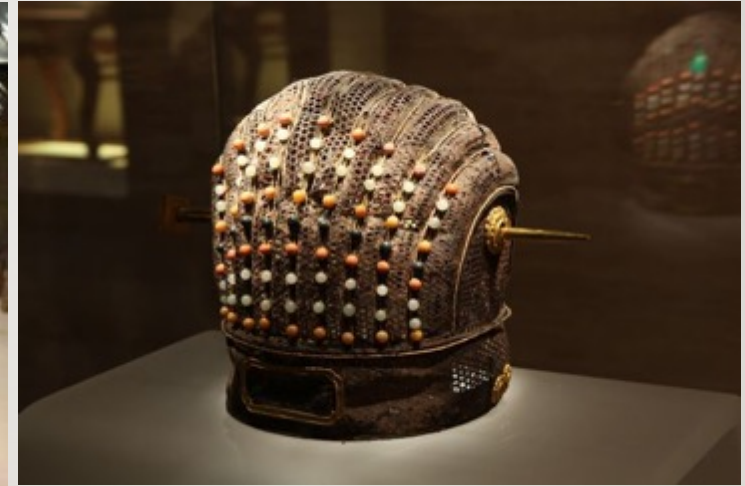
King of Lu State of Ming Dynasty Shandong Museum Jinan, Shandong Province