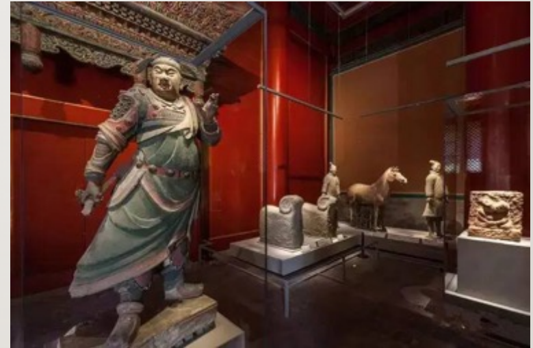
The newly opened sculpture hall, a permanent exhibition space in the Palace Museum, Beijing