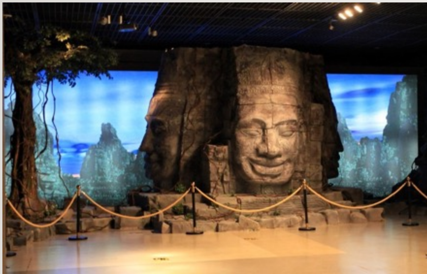
Smile of Khmer – Cambodian Ancient Cultural Relics and Arts Dec 2014 – Apr 2015 Capital Museum, Beijing